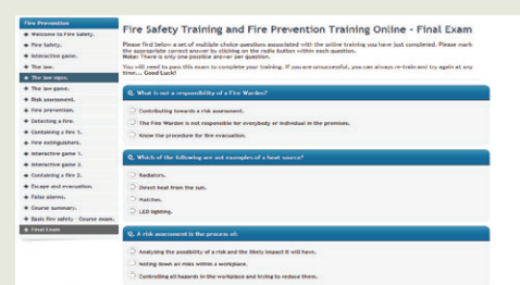
Final Exam – Certificates Provided.

Those responsible for workplaces must provide staff with suitable, sufficient and appropriate training to help prevent the outbreak of fire.